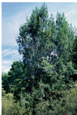
Allocasuarina littoralis Black she-oak

and we'd love to see you and your family/friends at these plantings.