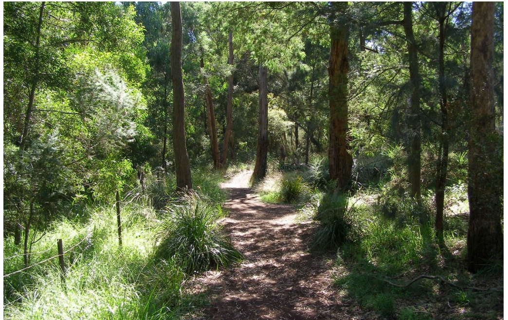
Valley Reserve, Mount Waverley