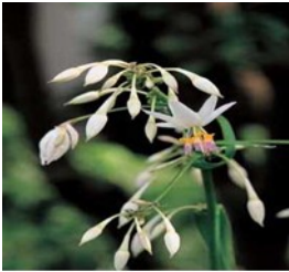
Artibropodium cirratum Renga Renga Lily

"Valley Reserve exists primarily as a conservation-oriented bushland reserve. It provides a most valuable resource for conservation education and for schools and the community to experience natural bushland within the city of Monash. All proposed developments for the reserve must be respectful of, and consistent with, this primary purpose."