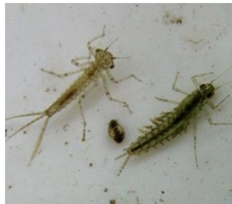
Damselfly larva and Mayfly nymph (L-R)

Valley Creek was flowing at a trickle, with very cloudy appearance (turbidity rated Degraded), and high conductivity (rated Fair).