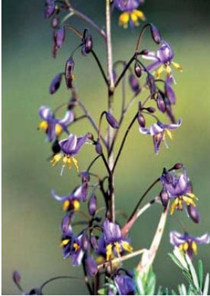
Dianella tasmanica Blue Flax Lily

The conservation of the scar tree is now complete and it is standing upright. The area surrounding the tree is in process of being landscaped and some interpretive signs will be placed nearby.