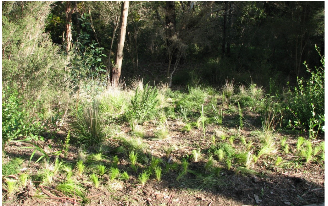
New plants along Scotchmans Creek — National Tree Day 2015

“but we still managed to get about 6,000 plants into the ground on the day as the rain stayed away until later on...”